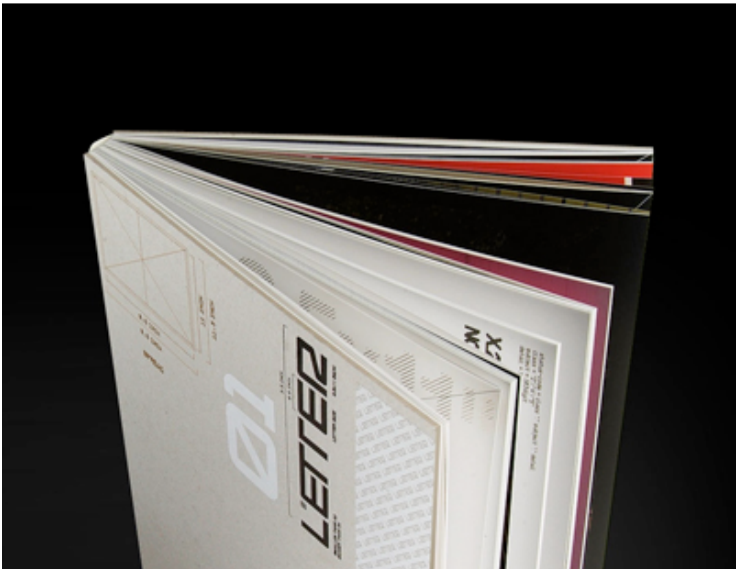
Letter 01, Book Design